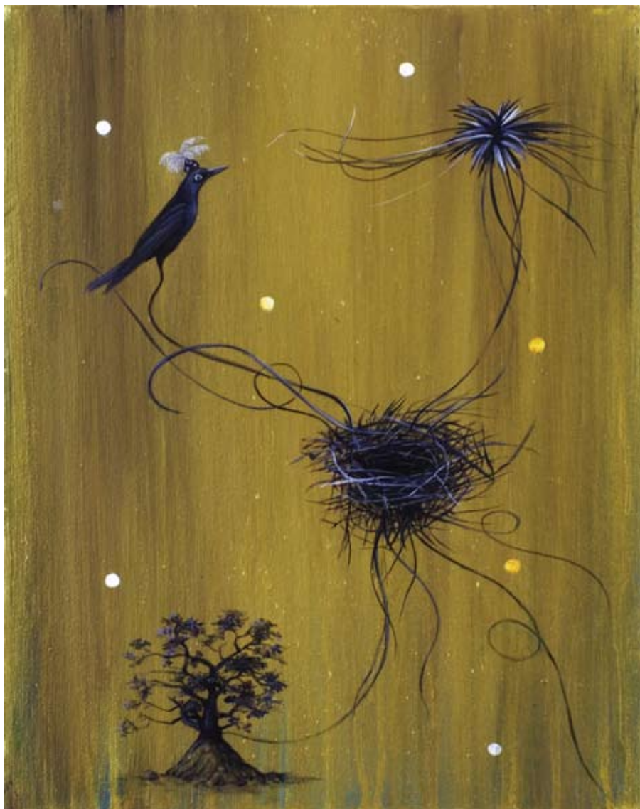
#11 Ephemeral Tales of Gaia #2 acrylic, oil, metallic powders on belgian linen 36 x 30 cm