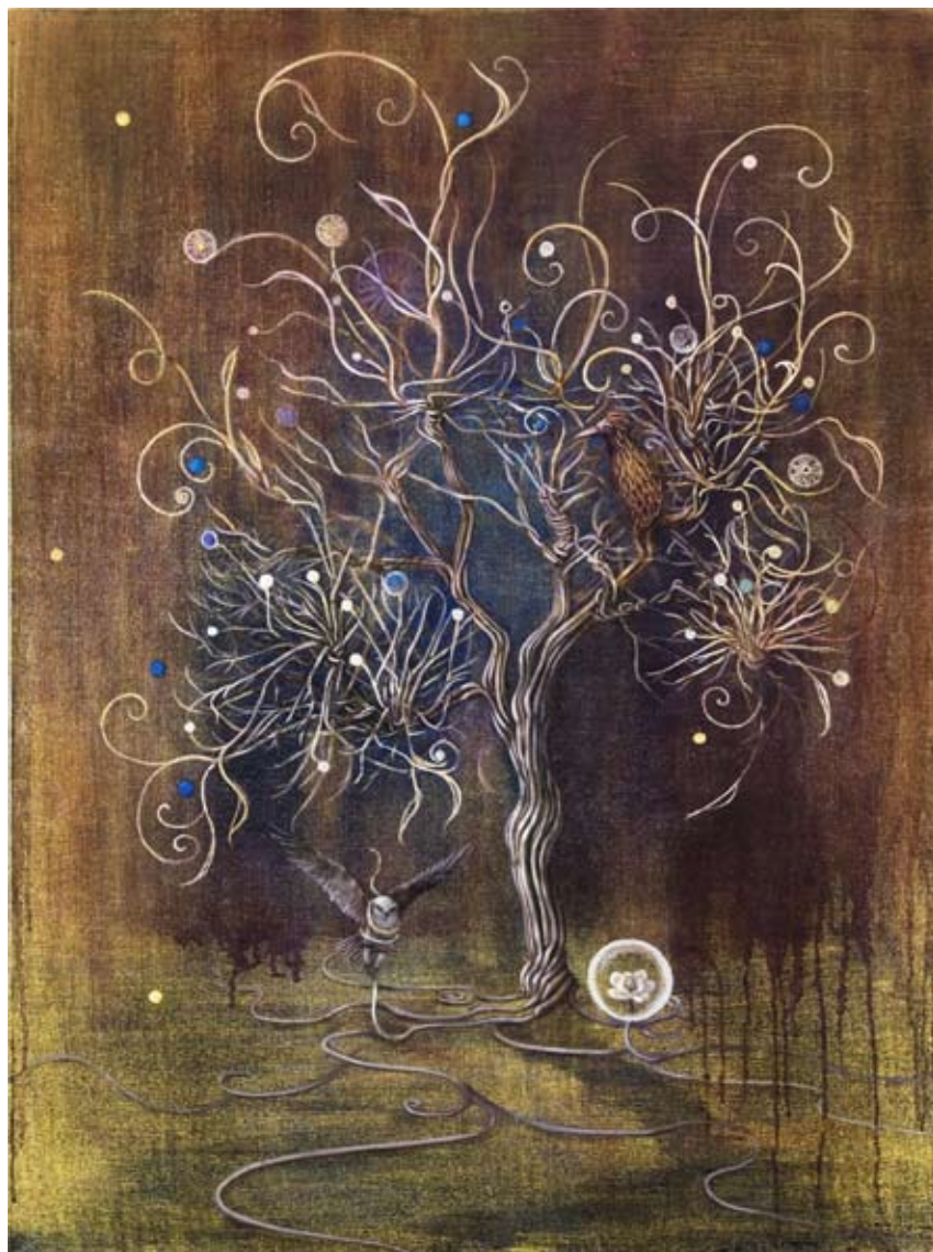
#03 The Tree of Oneness acrylic, oil, metallic powders on belgian linen 122 x 92 cm