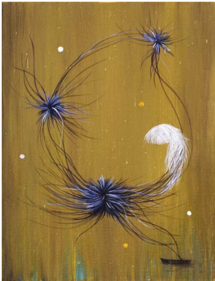
#17 Ephemeral Tales of Gaia #8 acrylic, oil, metallic powders on belgian linen 36 x 30 cm