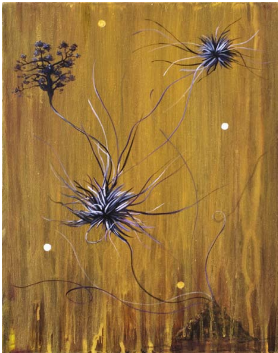
#10 Ephemeral Tales of Gaia #1 acrylic, oil, metallic powders on belgian linen 36 x 30 cm