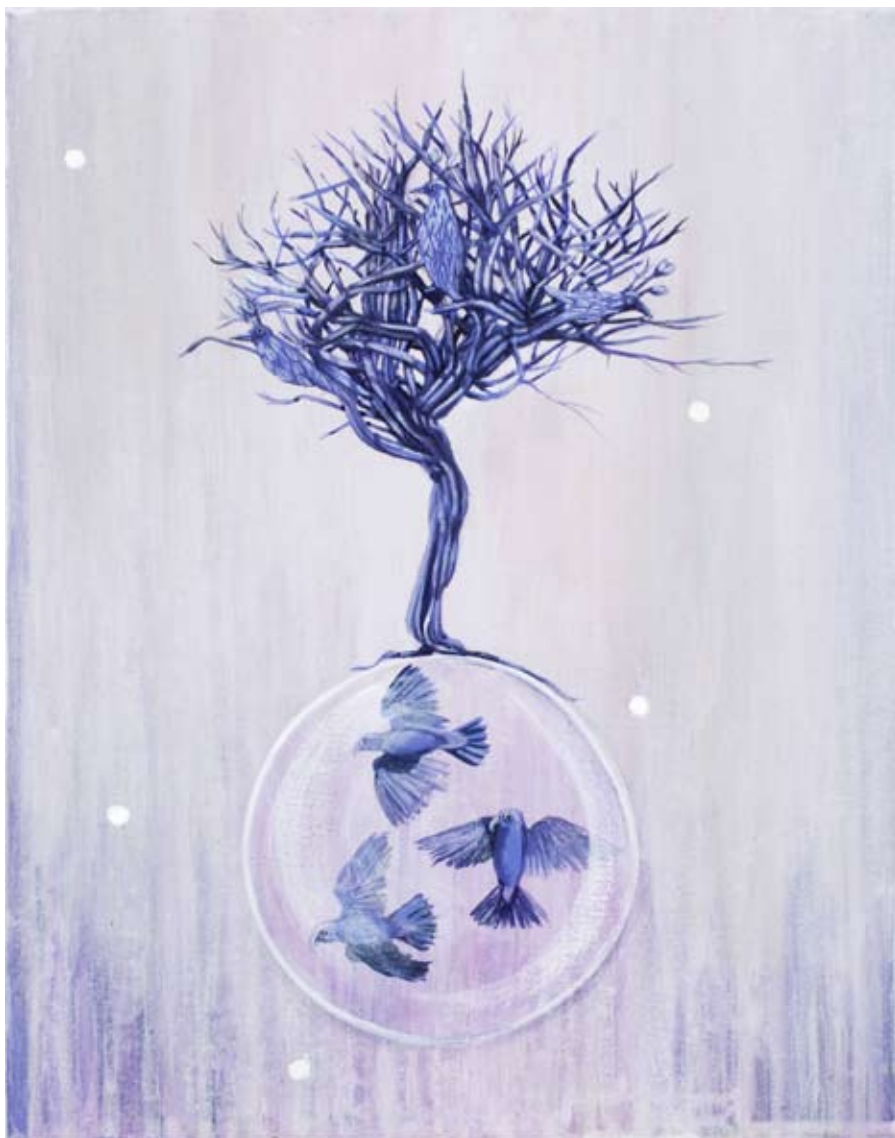
#15 Ephemeral Tales of Gaia #6 acrylic, oil, metallic powders on belgian linen 36 x 30 cm