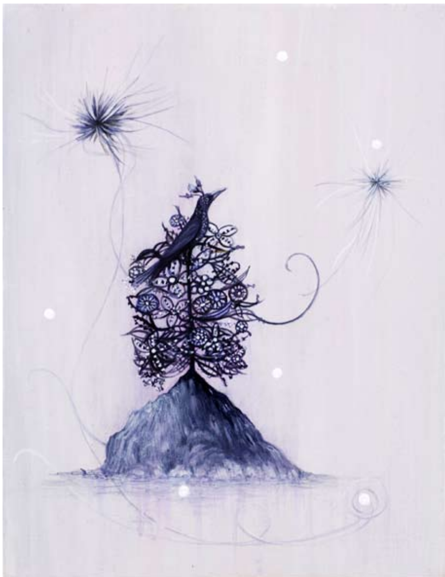
#12 Ephemeral Tales of Gaia #3 acrylic, oil, metallic powders on belgian linen 36 x 30 cm