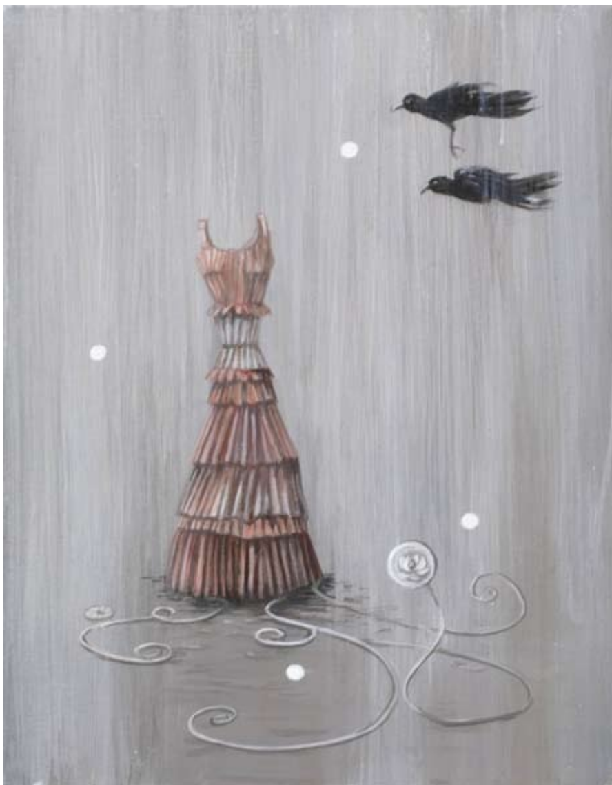
#19 Ephemeral Tales of Gaia #10 acrylic, oil, metallic powders on belgian linen 36 x 30 cm