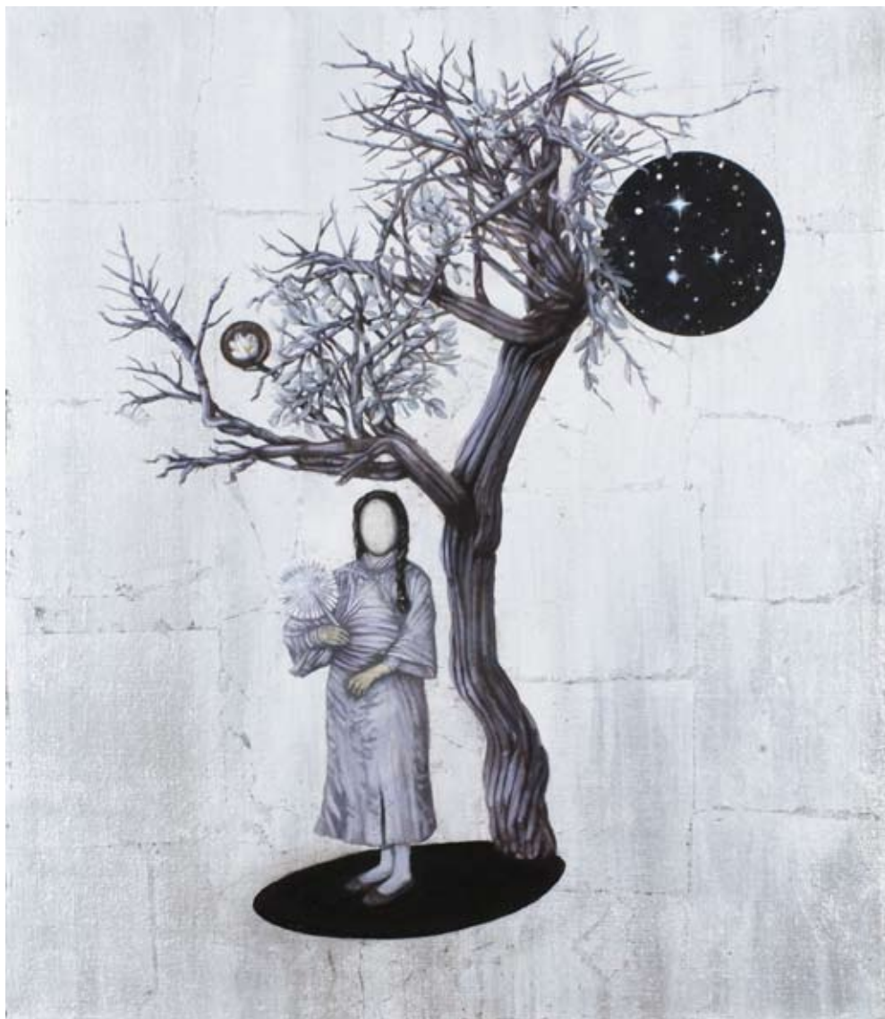
#05 Self Reflection acrylic, oil, metal leaf on belgian linen 76 x 66 cm