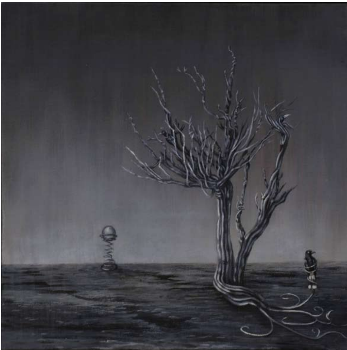
#08 Illusion of Maya acrylic on belgian linen 50 x 50 cm