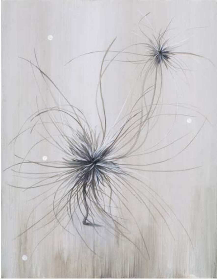
#18 Ephemeral Tales of Gaia #9 acrylic, oil, metallic powders on belgian linen 36 x 30 cm