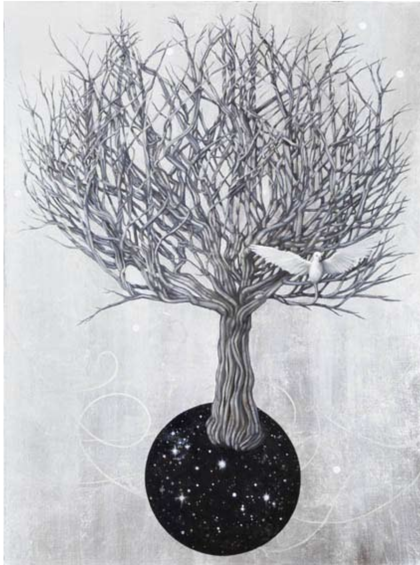
#04 Flight of Gaia acrylic, oil, metal leaf on belgian linen 122 x 84 cm