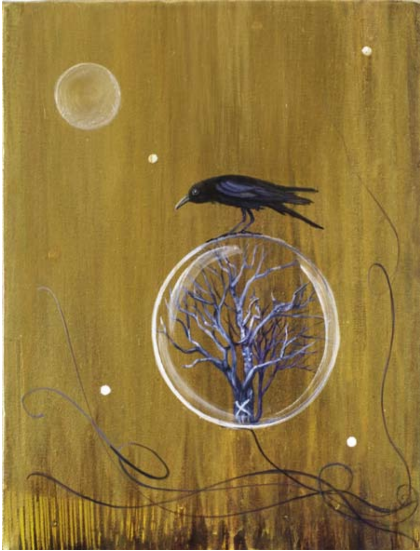
#14 Ephemeral Tales of Gaia #5 acrylic, oil, metallic powders on belgian linen 36 x 30 cm