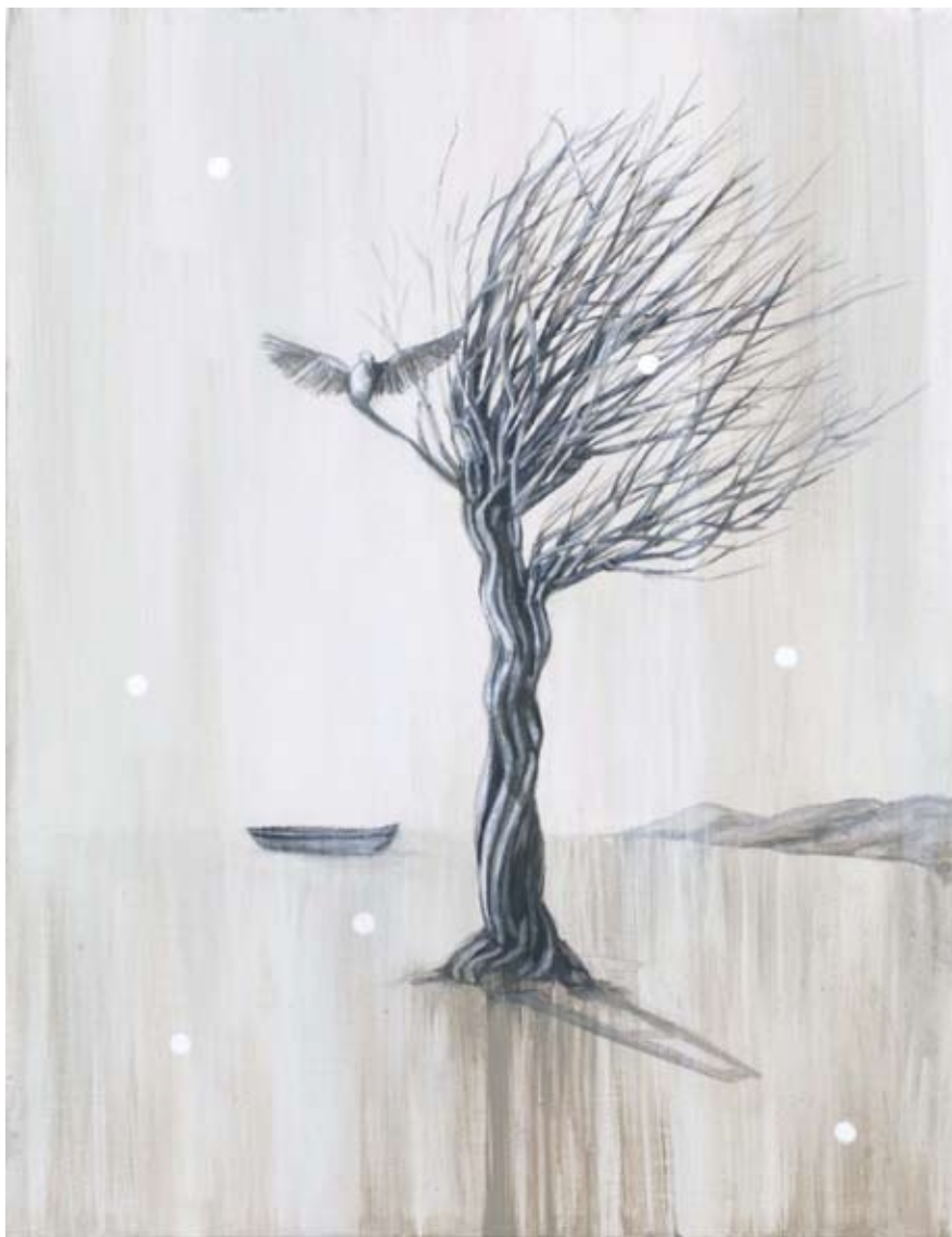
#16 Ephemeral Tales of Gaia #7 acrylic, oil, metallic powders on belgian linen 36 x 30 cm