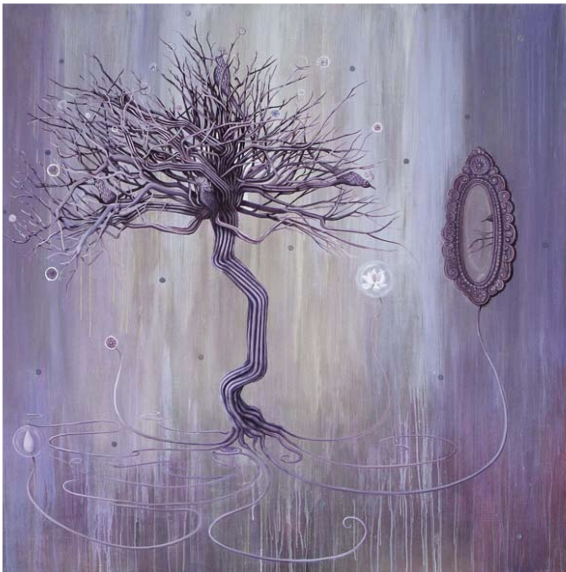
#01 Whispers Within acrylic, oil, metallic powders on belgian linen 168 x 168 cm