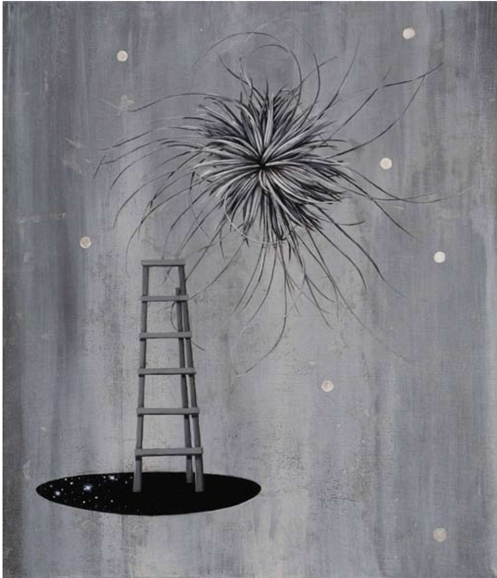
#06 Pathway acrylic on belgian linen 50 x 50 cm