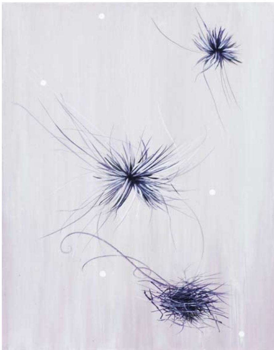
#13 Ephemeral Tales of Gaia #4 acrylic, oil, metallic powders on belgian linen 36 x 30 cm