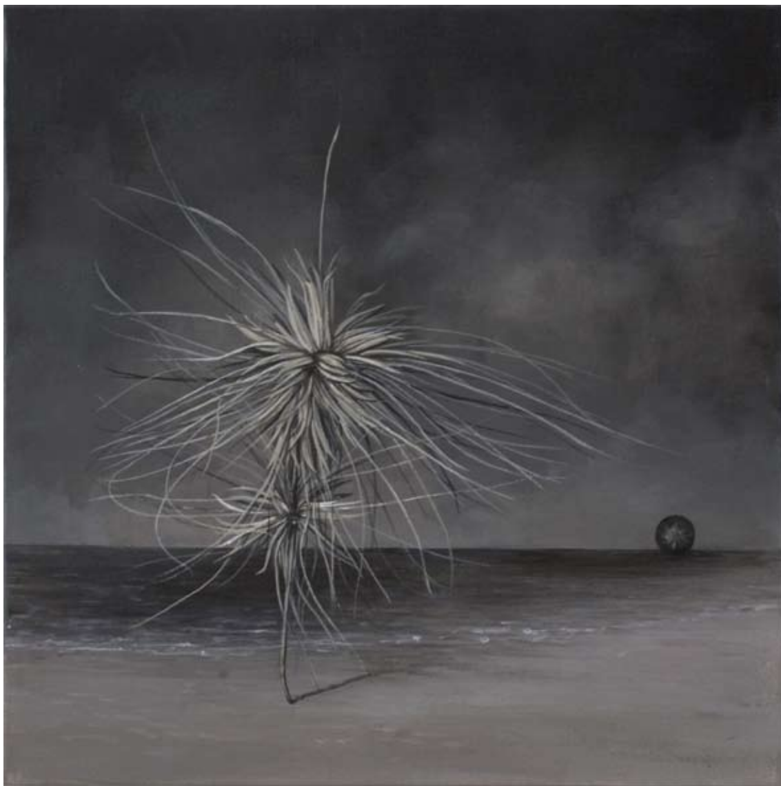
#09 Prophesy acrylic on belgian linen 50 x 50 cm