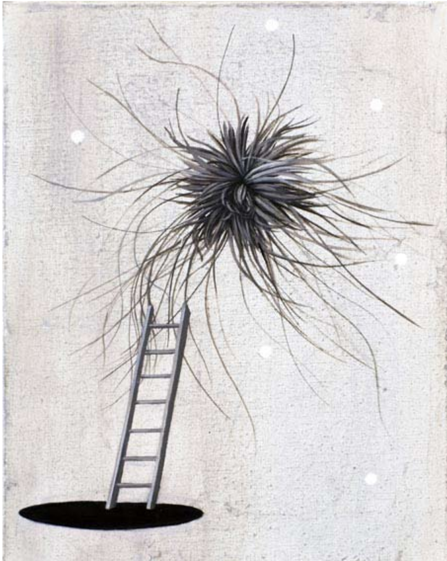
#21 Ephemeral Tales of Gaia #12 acrylic, oil, metallic powders on belgian linen 36 x 30 cm