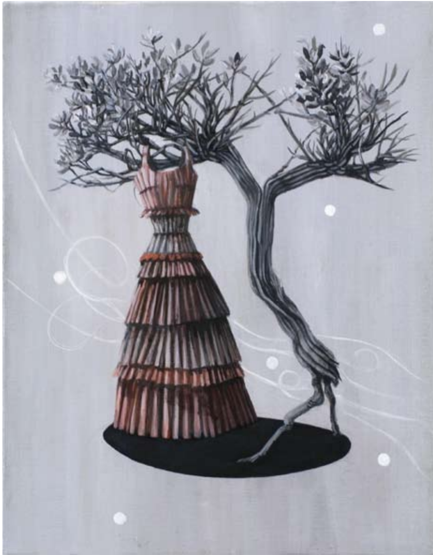
#20 Ephemeral Tales of Gaia #11 acrylic, oil, metallic powders on belgian linen 36 x 30 cm