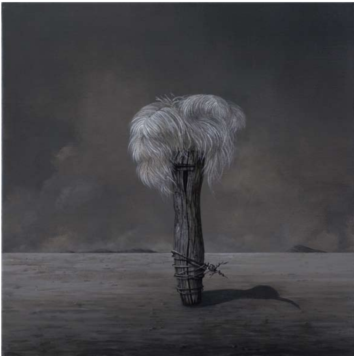
#07 For the Rustle of Leaves acrylic on belgian linen 50 x 50 cm