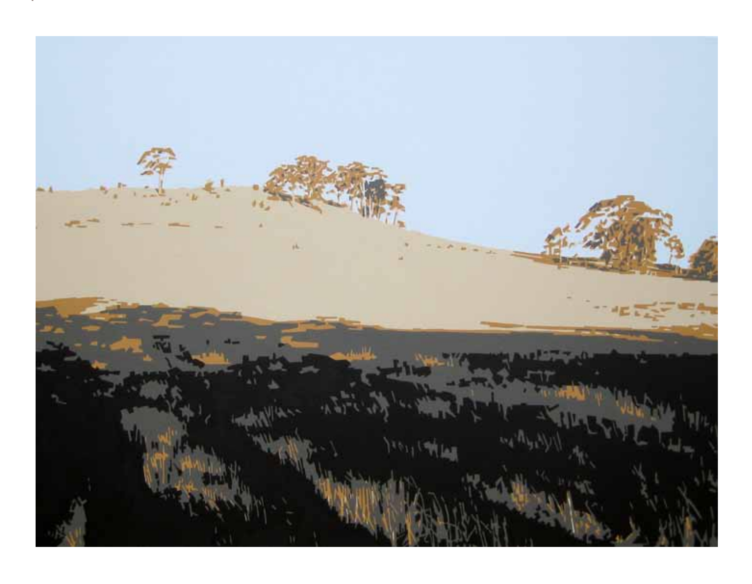
#04 Where The Shadows Play acrylic on canvas 100 x 137 cm