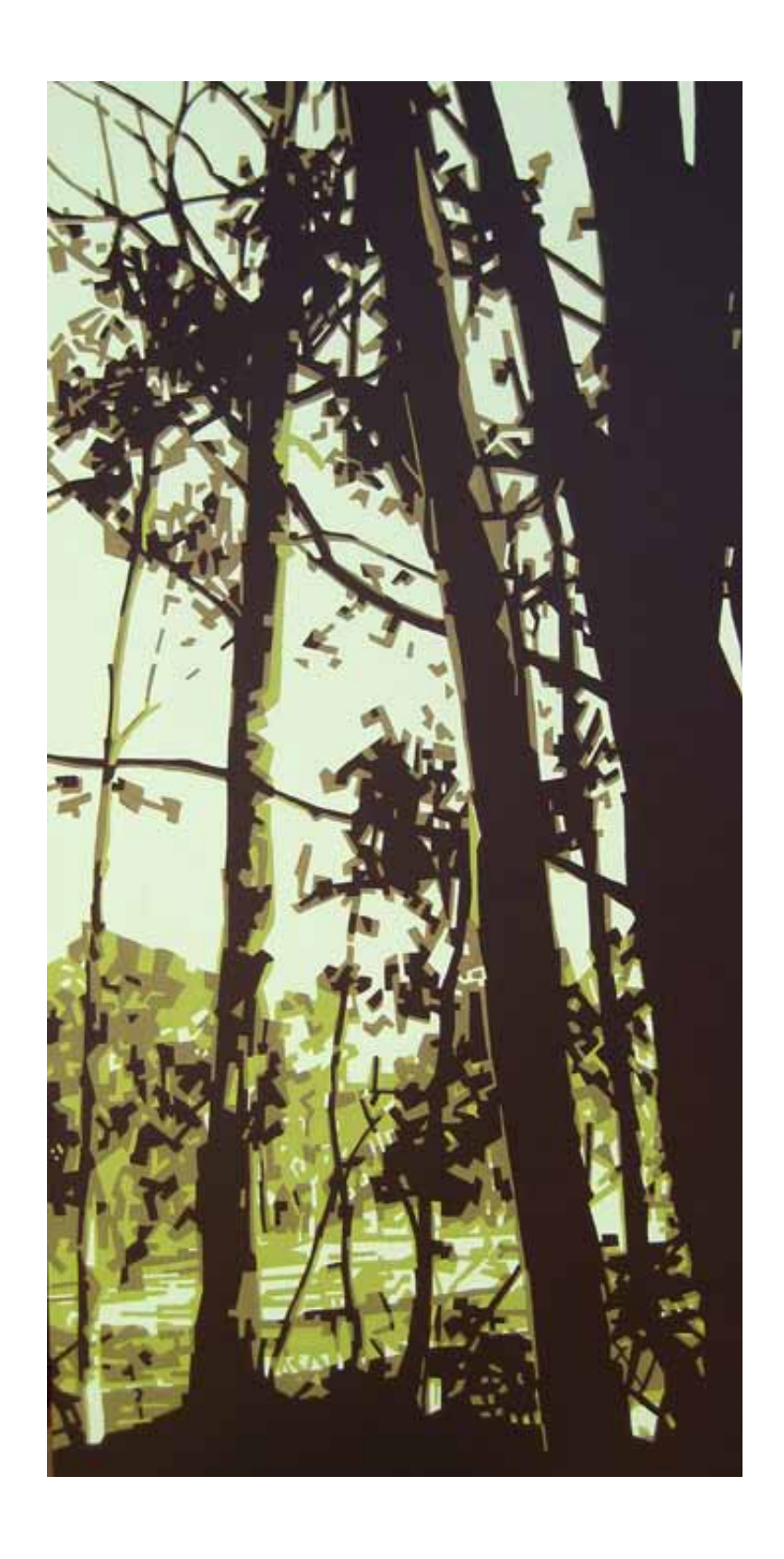
#07 Resting Memories In My Shade acrylic on canvas 100 x 50 cm