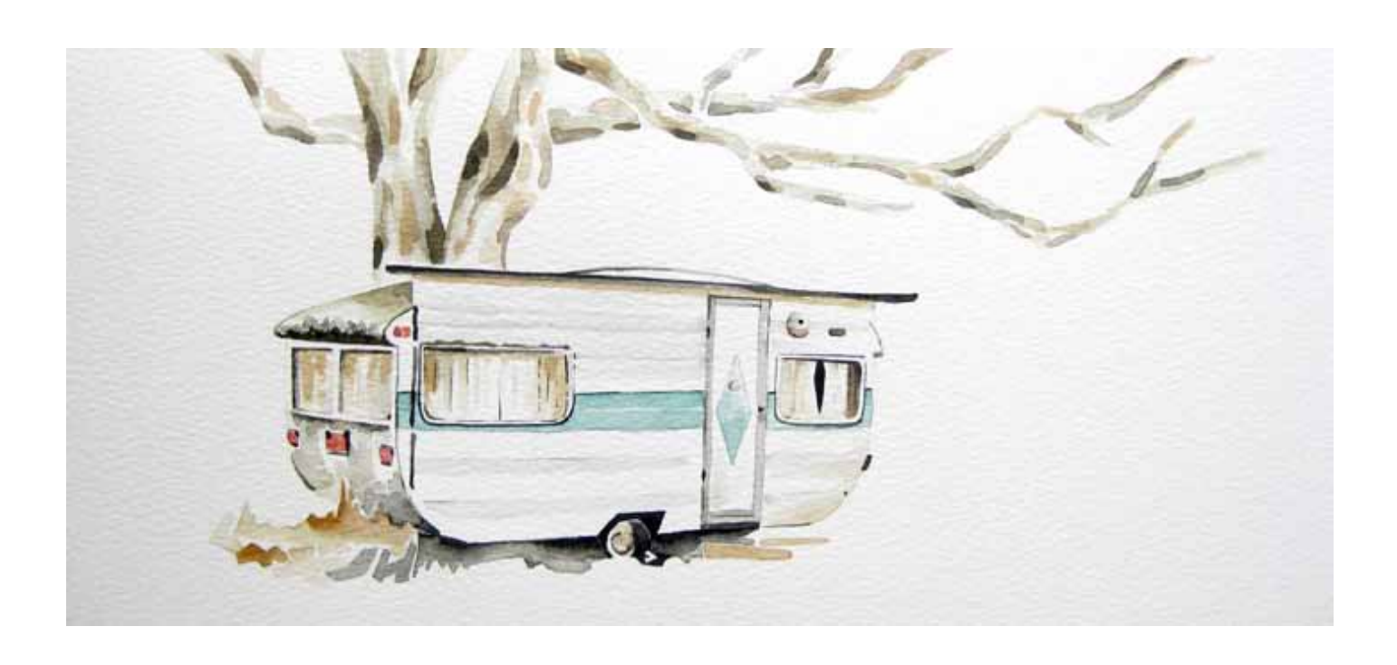
#14 Closed Curtains water colour on arches paper 28 x 75 cm