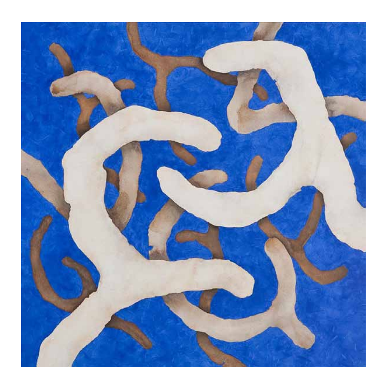
#12 The Morphology of Forgetting 3 acrylic on canvas 112h x 112w cm