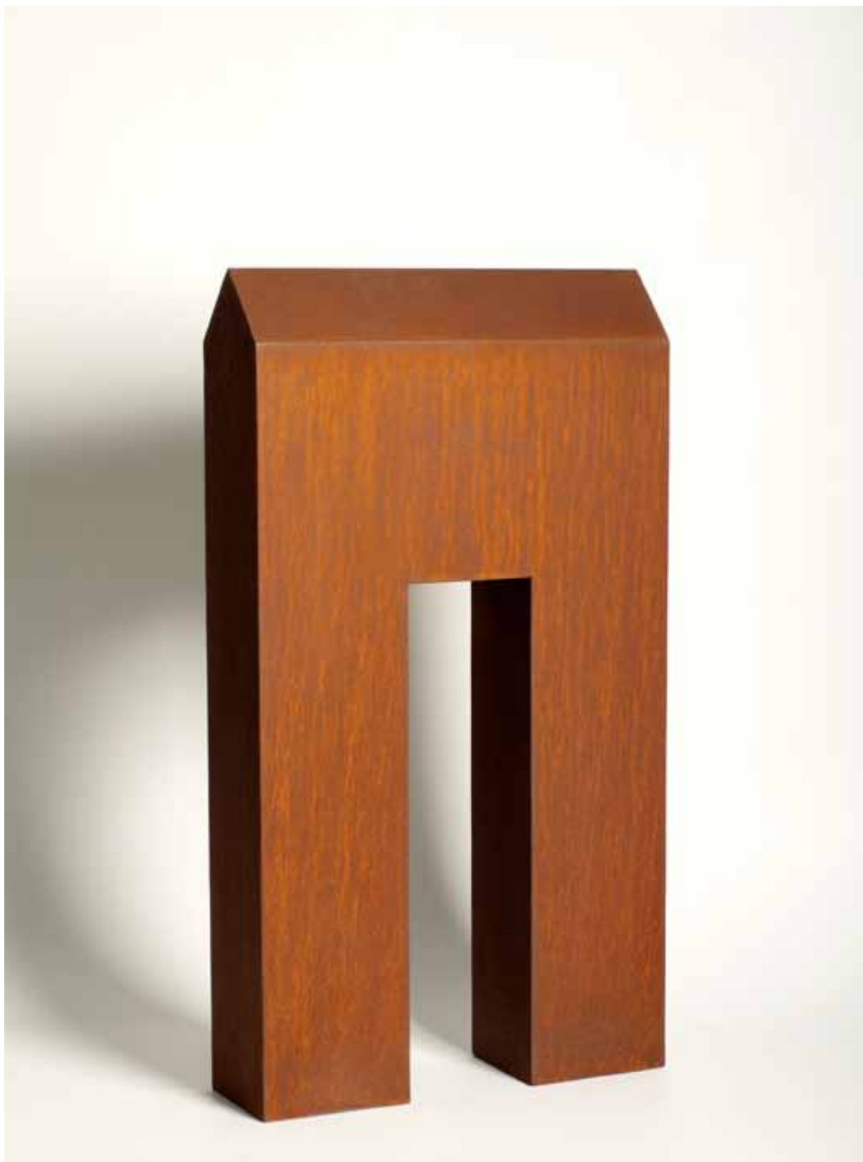
#11 Gatehouse patinated mild + corten steel 60H x 35W x 10.5cmD