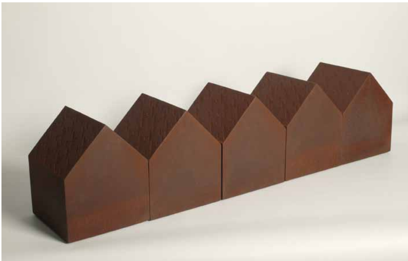
#10 Himmel Street Houses patinated mild + corten steel 22.5H x 95W x 18cmD