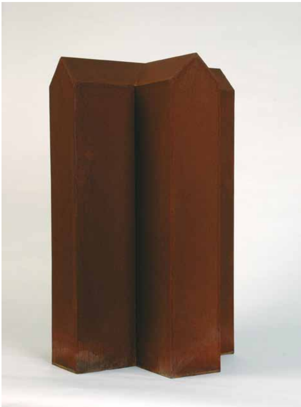
#05 High Church patinated mild + corten steel 11H x 39W x 22cmD