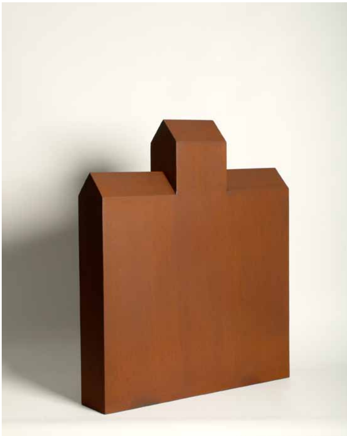
#07 Broad Church patinated mild + corten steel 65H x 55W x 10.5cmD