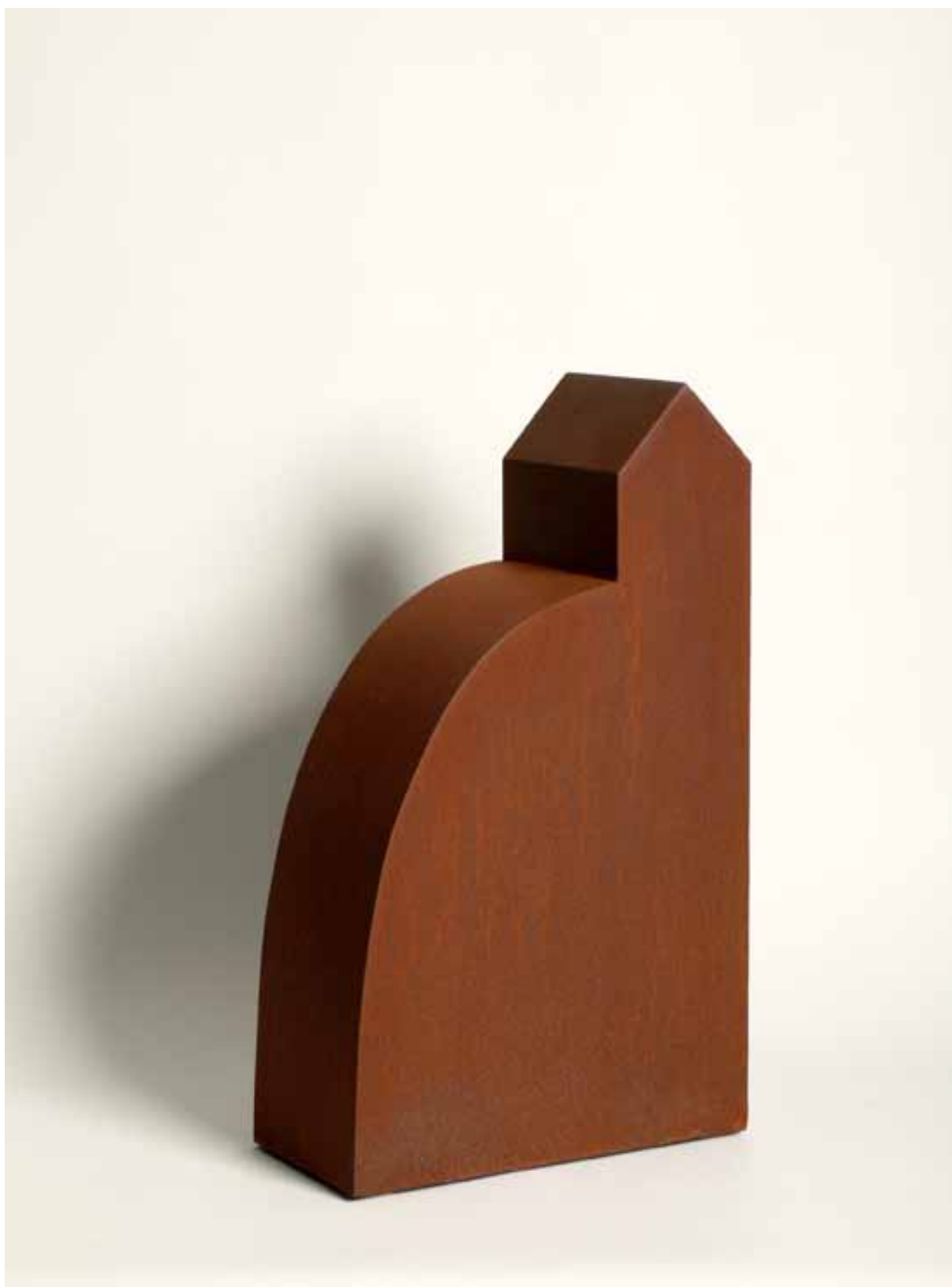
#12 Chapel patinated mild + corten steel 40H x 30W x 14.5cmD