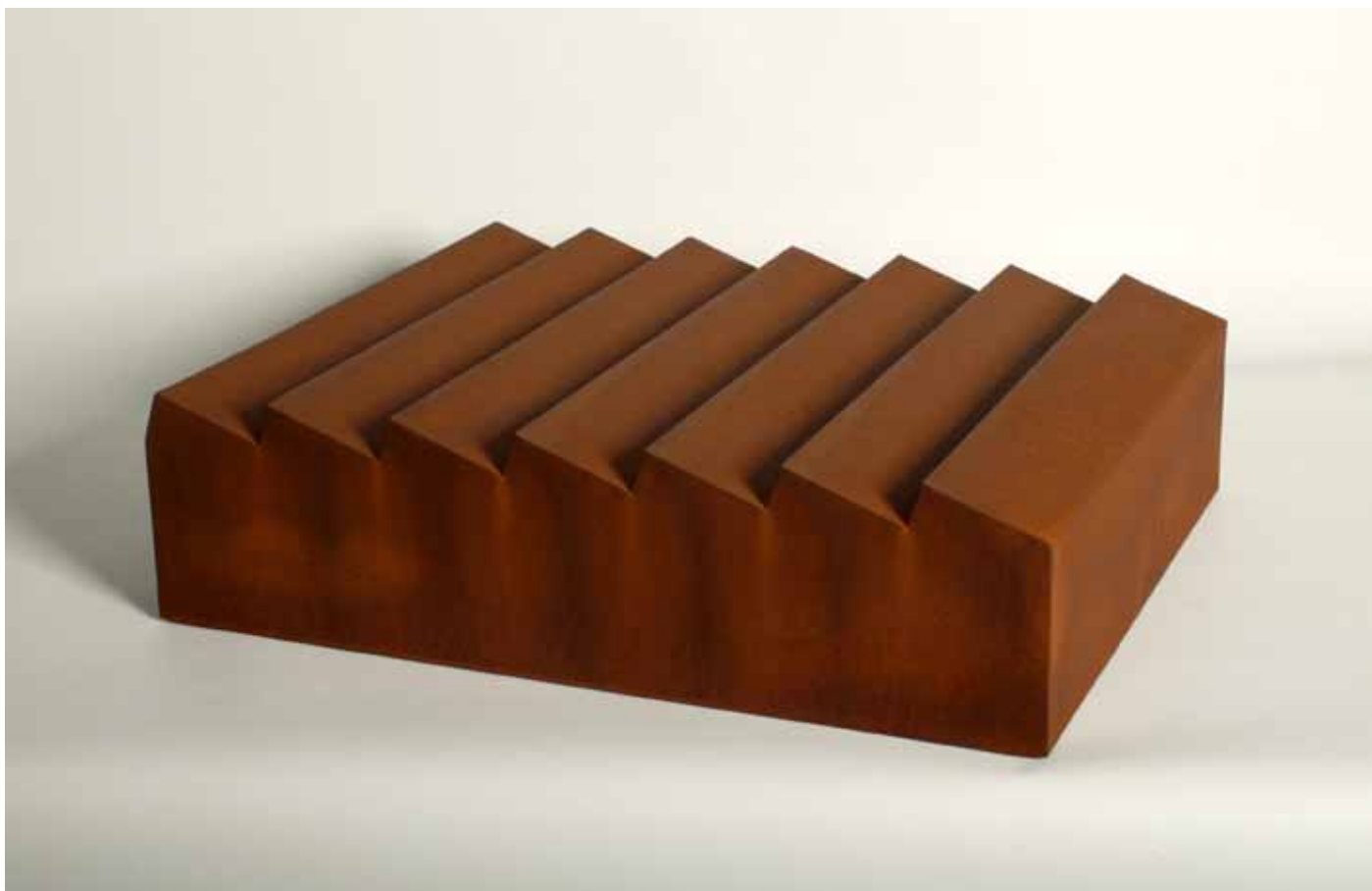
#09 Sawtooth patinated mild + corten steel 15H x 56W x 45cmD