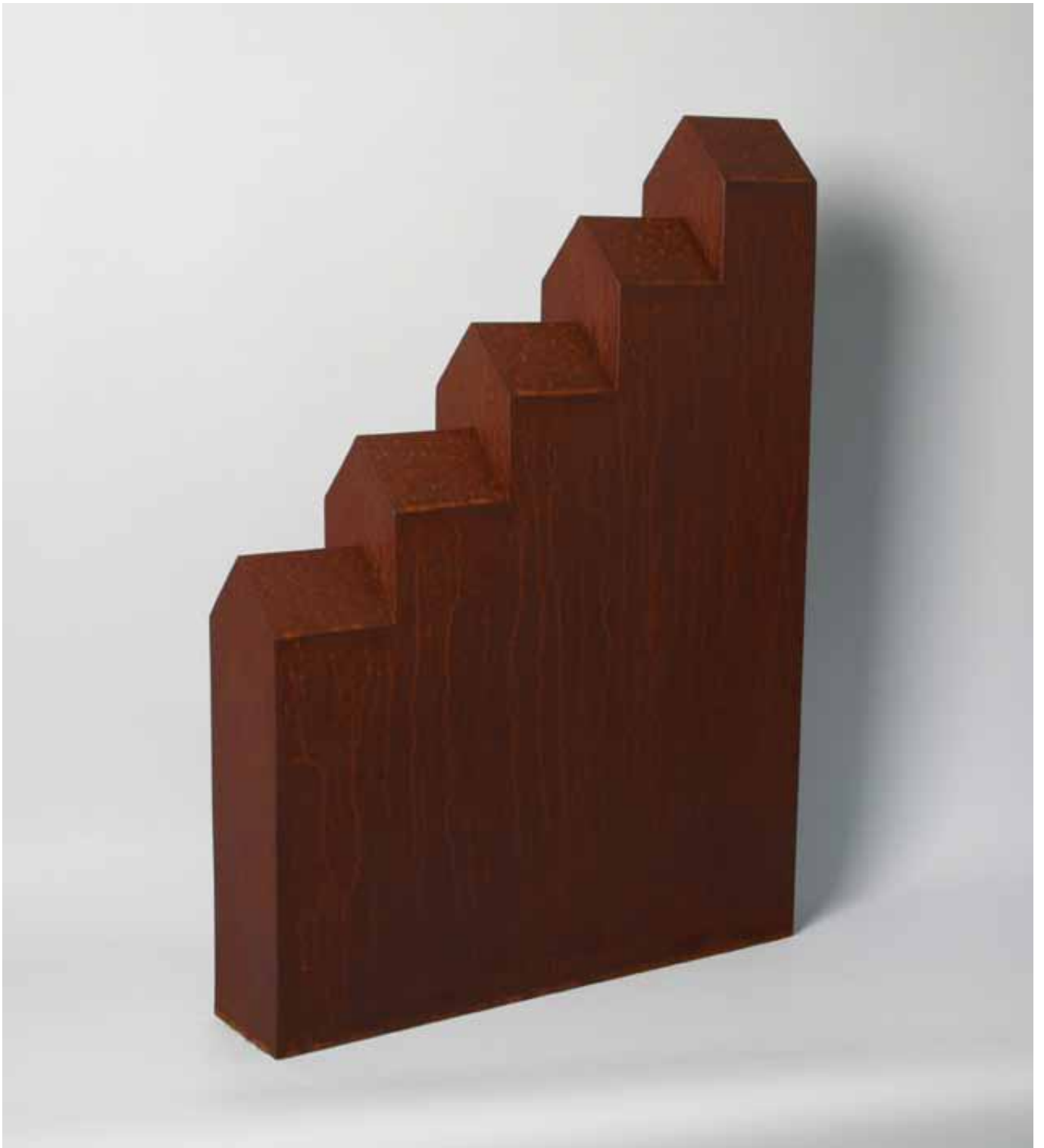
#02 Steps I patinated mild + corten steel 68H x 50W x 10.5cmD