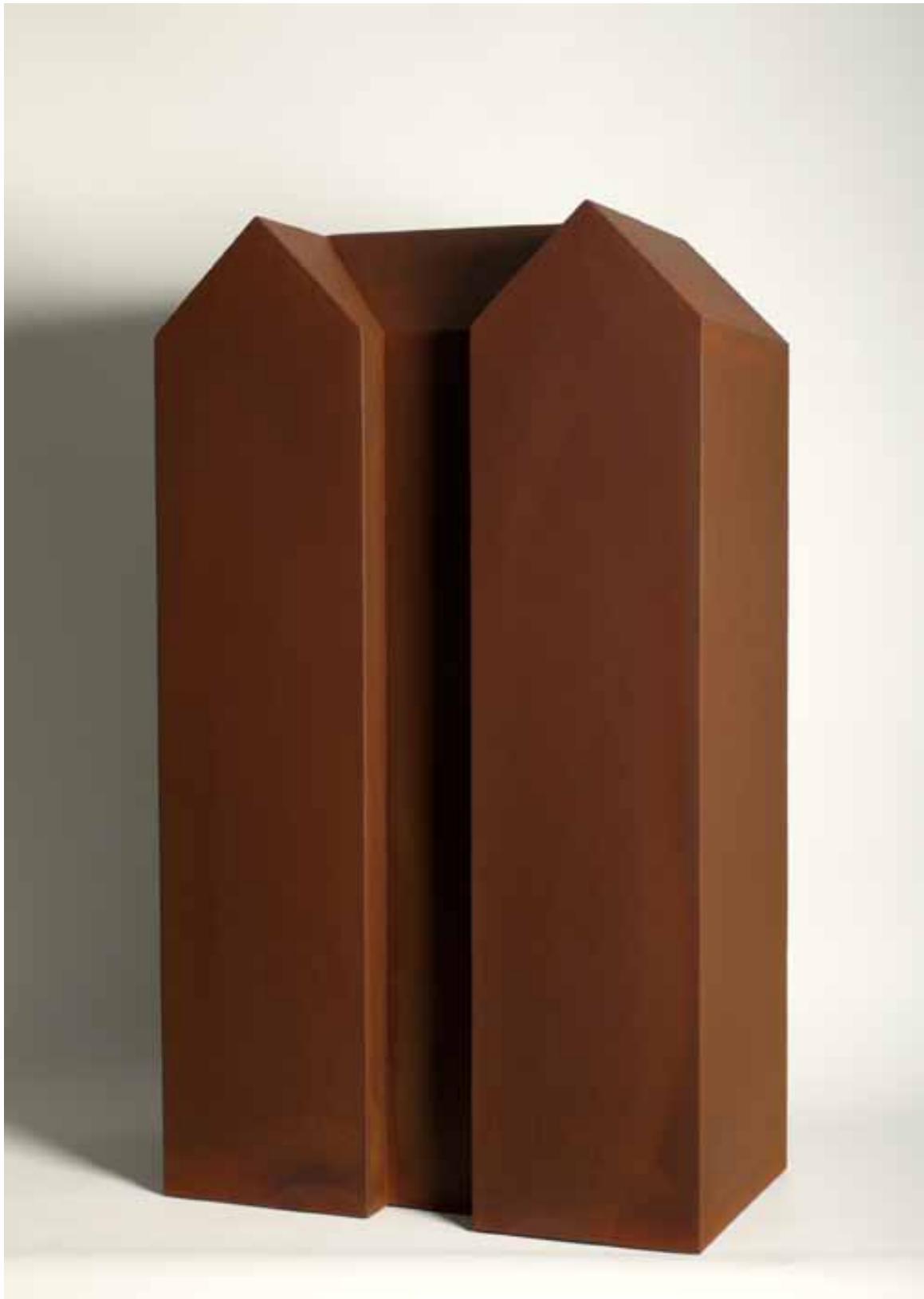
#08 H House patinated mild + corten steel 90H x 52W x 30cmD