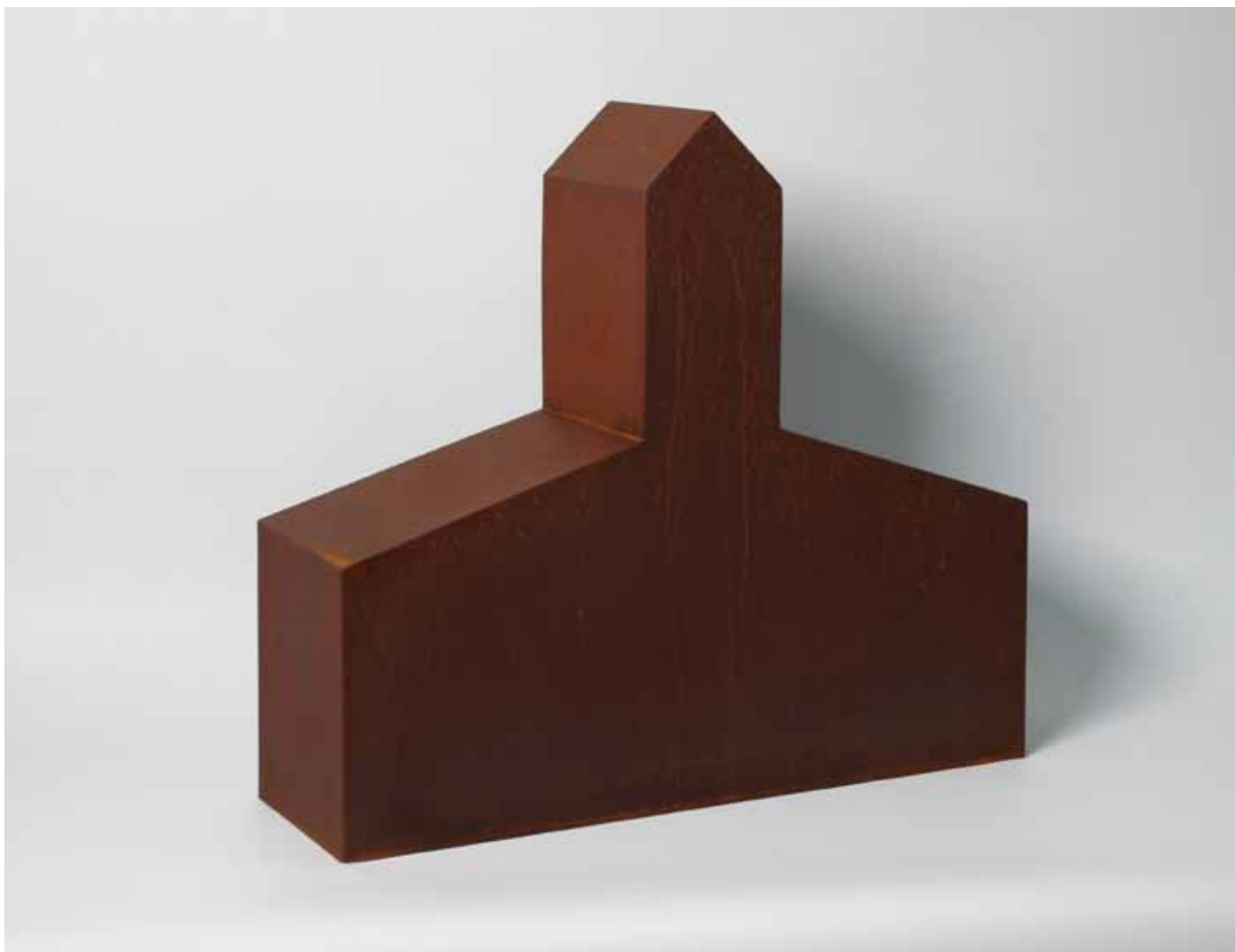
#01 Low Church patinated mild + corten steel 48H x 52W x 14cmD