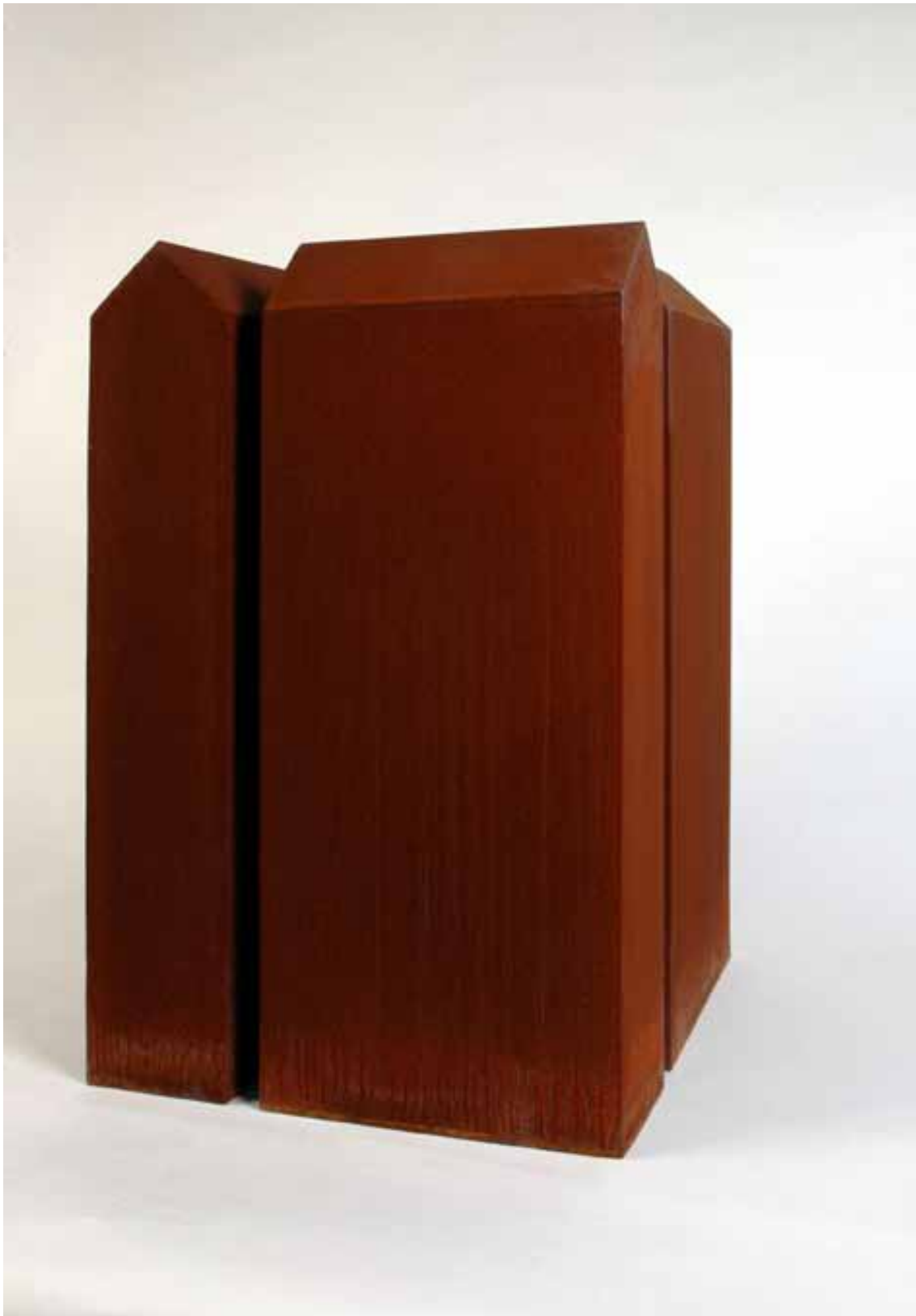
#04 Courtyard patinated mild + corten steel 60H x 50W x 50cmD