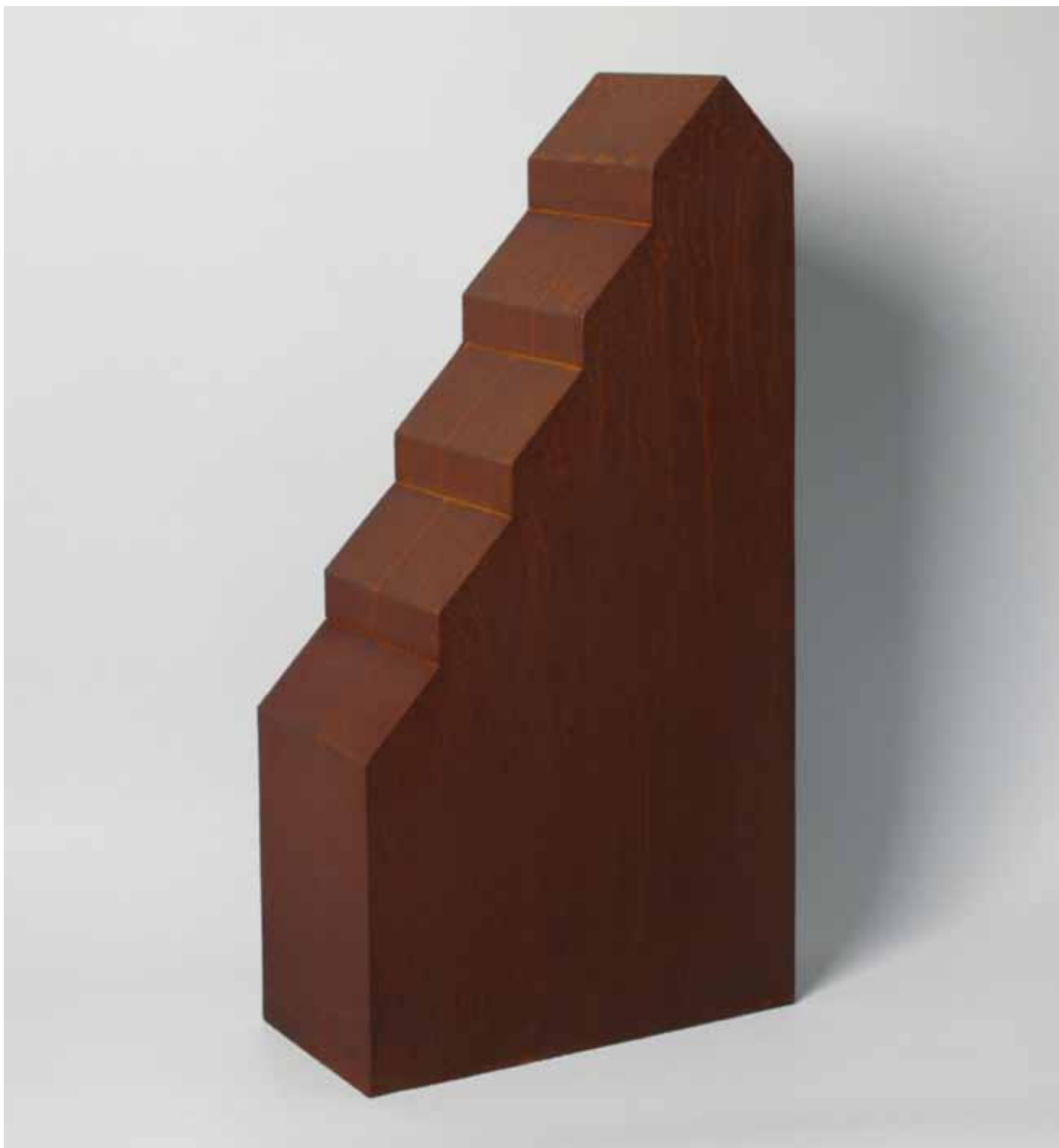
#03 Steps II patinated mild + corten steel 58H x 31W x 13.5cmD