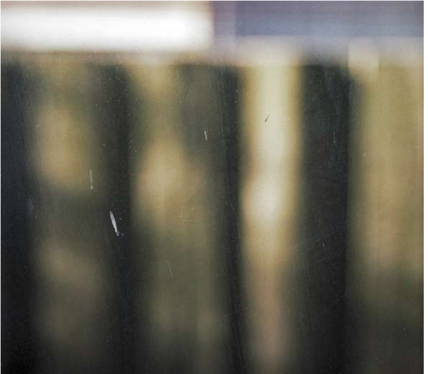
#09 MNH # 9 [2008] Type C print 101 x 114 cm