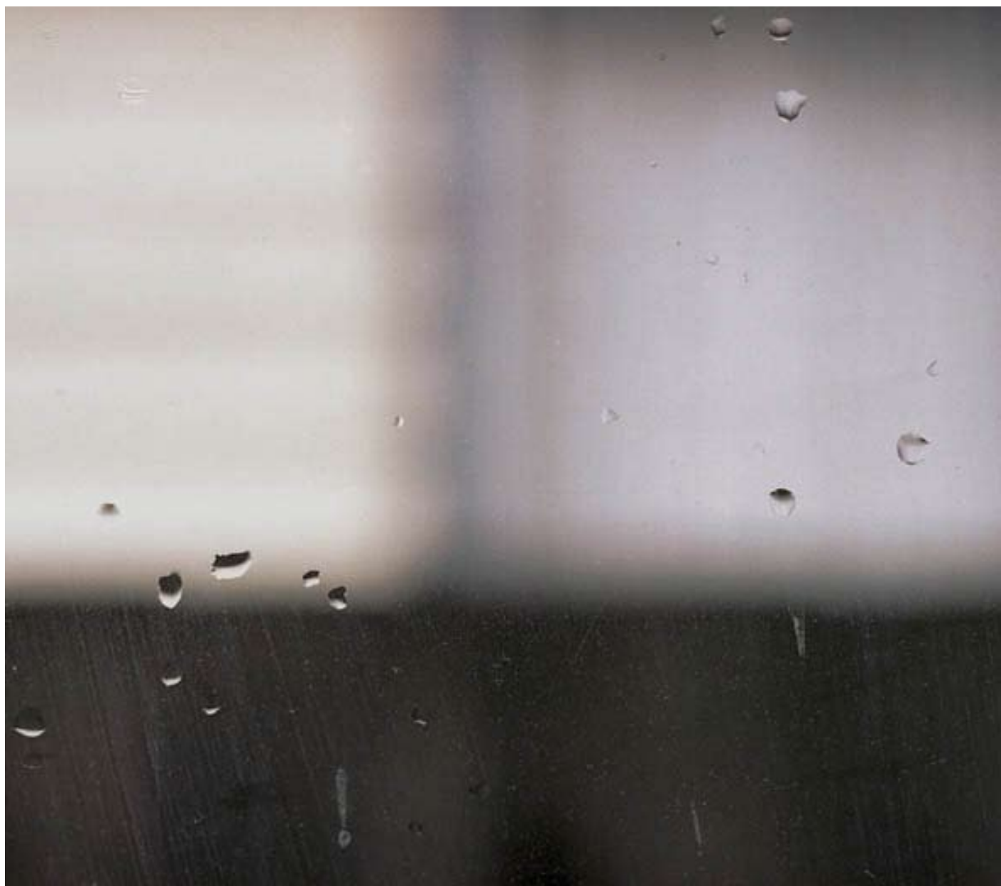
#10 MNH # 10 [2008] Type C print 101 x 114 cm