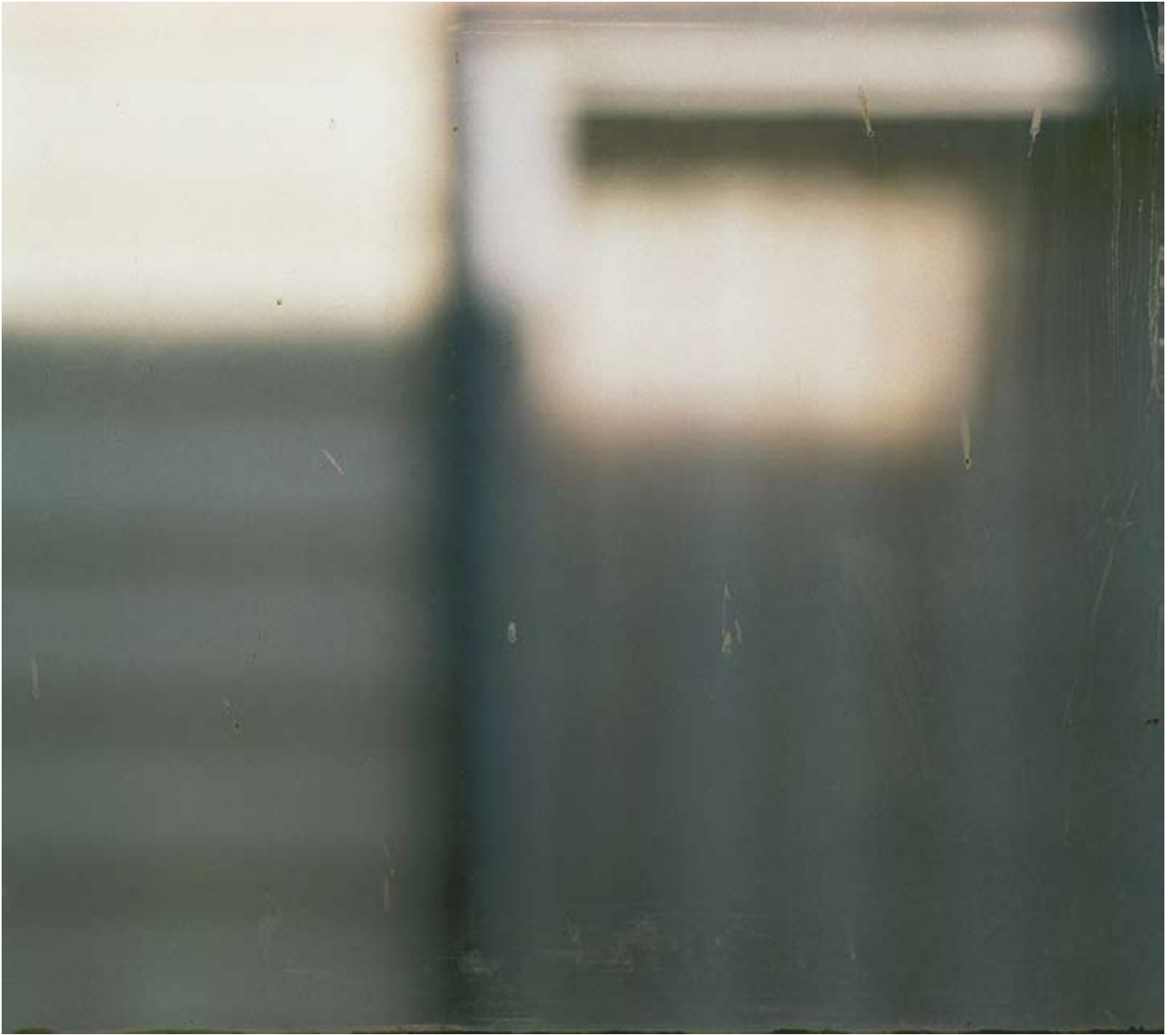
#01 MNH # 1 [2006] Type C print 101 x 114 cm