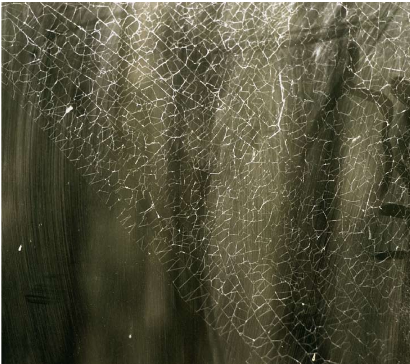
#04 MNH # 4 [2006] Type C print 101 x 114 cm