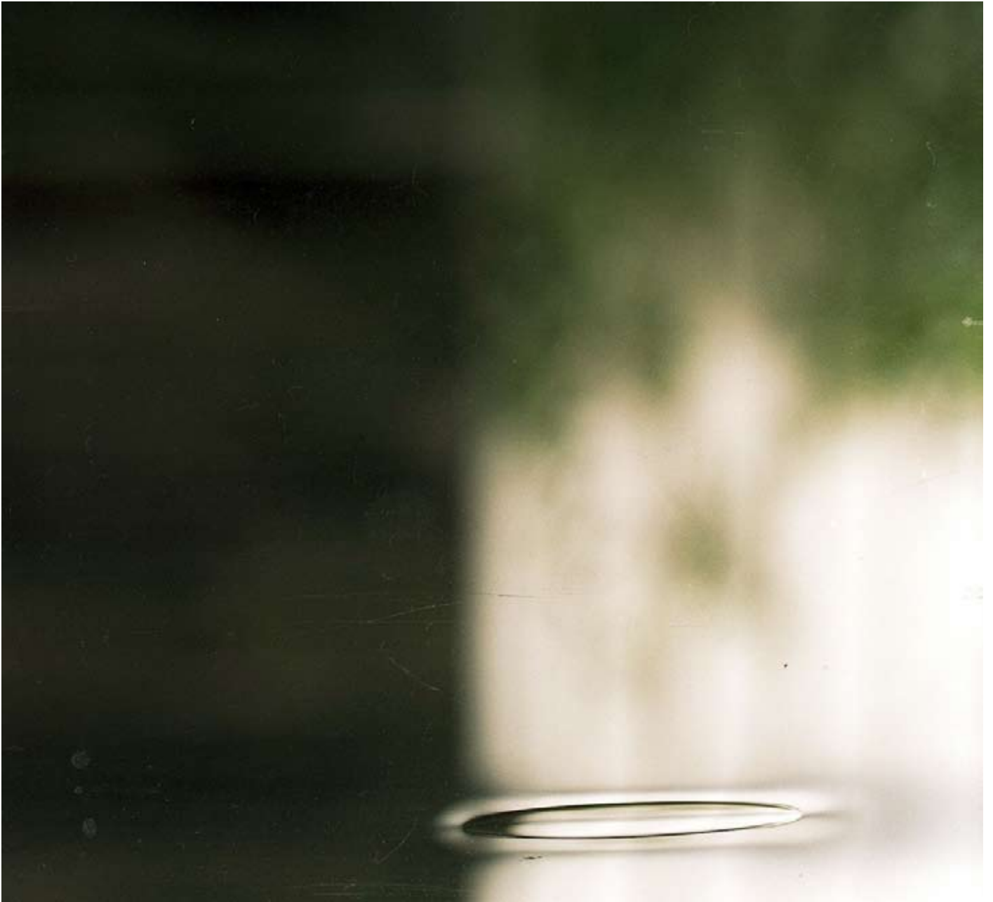
#07 MNH # 7 [2007] Type C print 101 x 114 cm