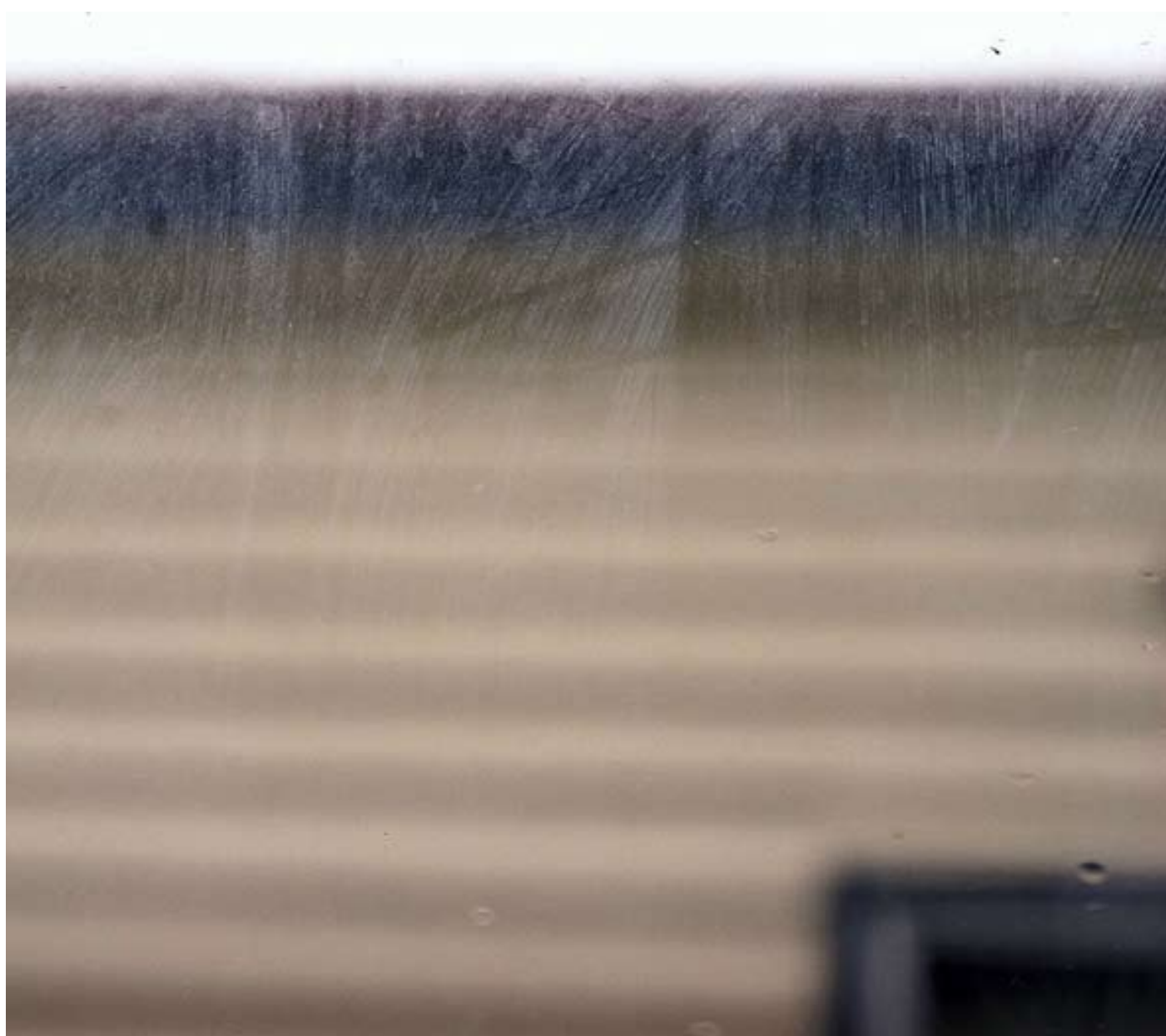
#08 MNH # 8 [2008] Type C print 101 x 114 cm