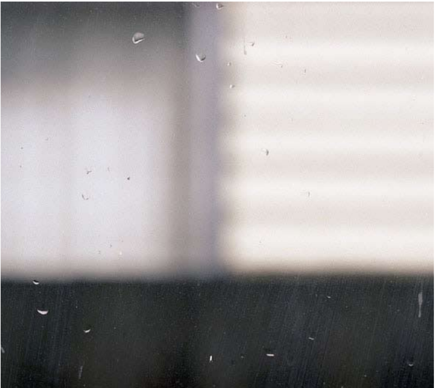
#11 MNH # 11 [2008] Type C print 101 x 114 cm