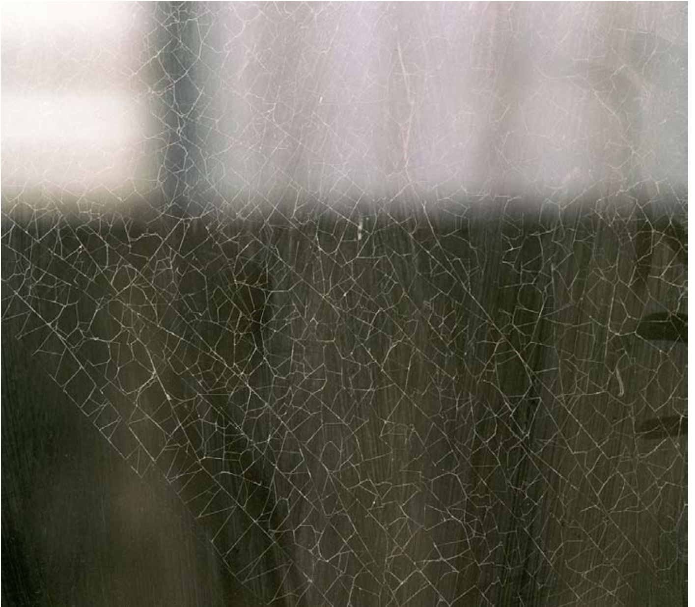
#05 MNH # 5 [2006] Type C print 101 x 114 cm