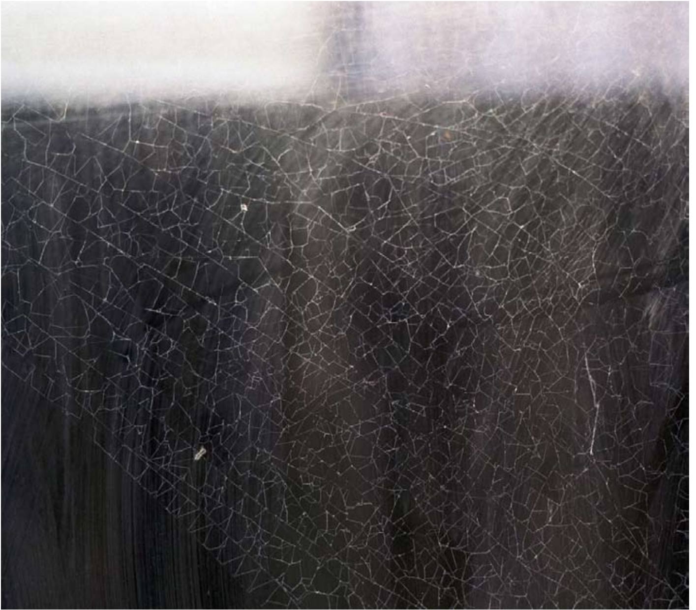
#03 MNH # 3 [2006] Type C print 101 x 114 cm