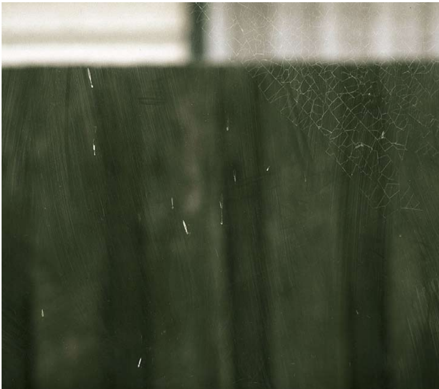
#06 MNH # 6 [2006] Type C print 101 x 114 cm